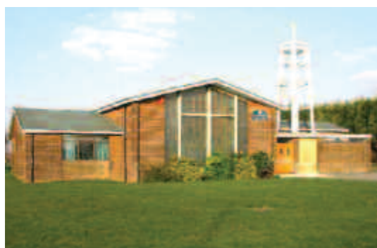
The existing Church on the Oval